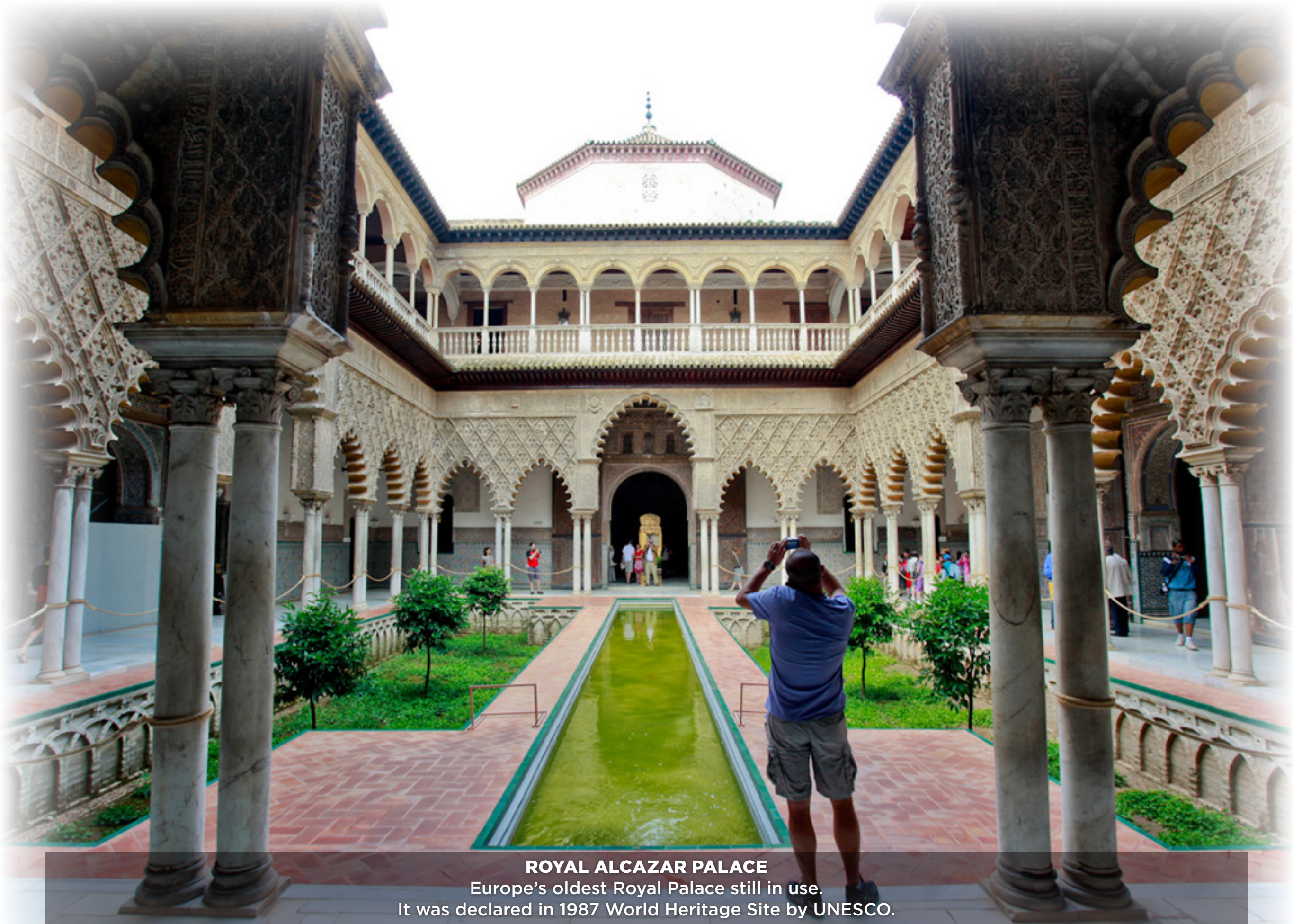
ROYAL ALCAZAR PALACE Europe's oldest Royal Palace still in use. It was declared in 1987 World Heritage Site by UNESCO.